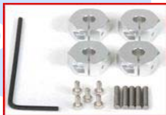
53569 – Clamp Type Aluminium Wheel Hub (6mm Thick)