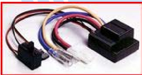
45029 ESC TEU-101BK

Configuration of wires must be as supplied, however wires can be cut to length. Battery connector may be changed for different connectors (i.e. Deans Ultra, Power poles etc.). Bullet motor connectors may be removed to allow direct soldering to motors. Original switch must remain as standard, but can be mounted in an alternate position if required. The fitting of a power cap is not allowed. 3 step mechanical Speedos are no longer allowed