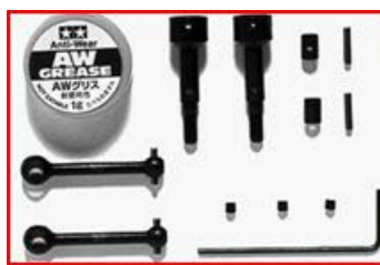
53597 – M03 Assembly Universal Shaft Set