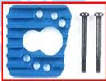
49444 M-03R Aluminium Motor Heat sink

Aluminium hardware parts including screws, ball joints and turnbuckles maybe used. No other Hop up parts may be used, unless notification of change is made during the season. Non Tamiya or other Tamiya hop-up bearings of the same size (e.g. 53008, 53029 & 53066) can be used in place of metal or plastic bushes. Bearing shields may not be removed. Any Tamiya Spring may be used as long as it is without modification.