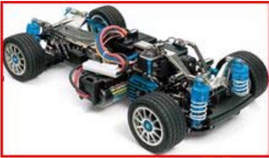
49417 M-03R Chassis

Aluminium hardware parts including screws, ball joints and turnbuckles maybe used. No other Hop up parts may be used, unless notification of change is made during the season. Non Tamiya or other Tamiya hop-up bearings of the same size (e.g. 53008, 53029 & 53066) can be used in place of metal or plastic bushes. Bearing shields may not be removed. Any Tamiya Spring may be used as long as it is without modification.