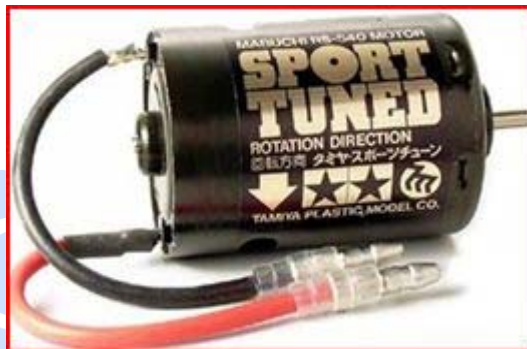
53086 Tamiya RS540 Sport Tuned

The motors must remain un-tampered, however cleaning of the motor is allowed. This includes the use of cleaning fluids, cotton buds and fibre/comm. sticks. Running in/comm. drops and lubricants are also permitted. Anything other than this is not allowed and may result in disqualification from the event. Water dipping of motors is also not permitted. Maximum of 1 motor cooling fans may be used (maximum size 30mmx30mm)