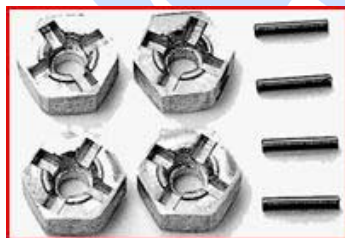
53056 – Pin Type Wheel Adaptor