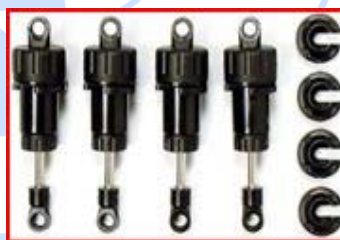
53619 – CVA Mini Dampers