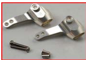
53523 – M03/04 Aluminium Front Uprights