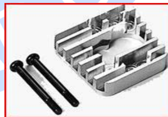
53344 – M03 Aluminium Heat sink