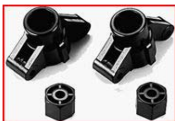
53345 – M03 Toe-in Uprights eccc mini rules rev. 1.1