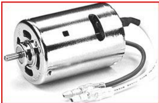
53689 Tamiya 540-J Motor