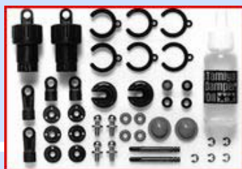
50746 – CVA Super Mini Dampers