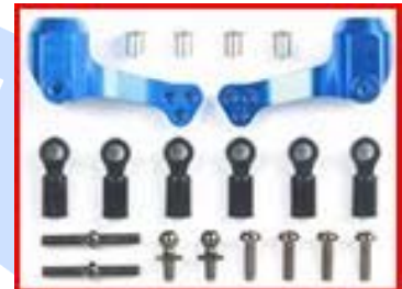
49441 M-03R Aluminium Front Uprights