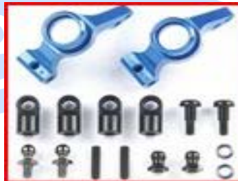
49442 M-03R Aluminium Rear Uprights (Toe-in)