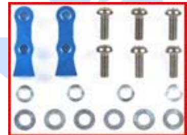
49443 M-03R Aluminium Servo Mount